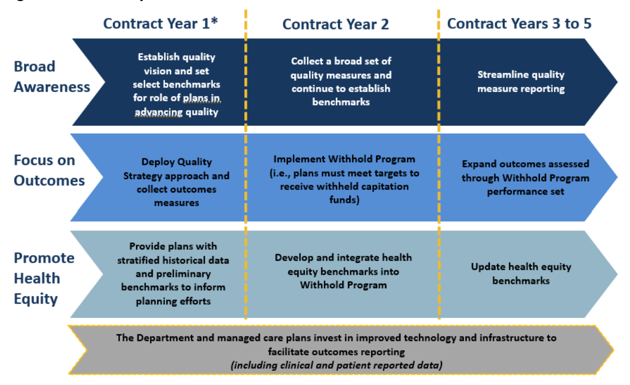
Figure 1: The Quality Vision Over Time